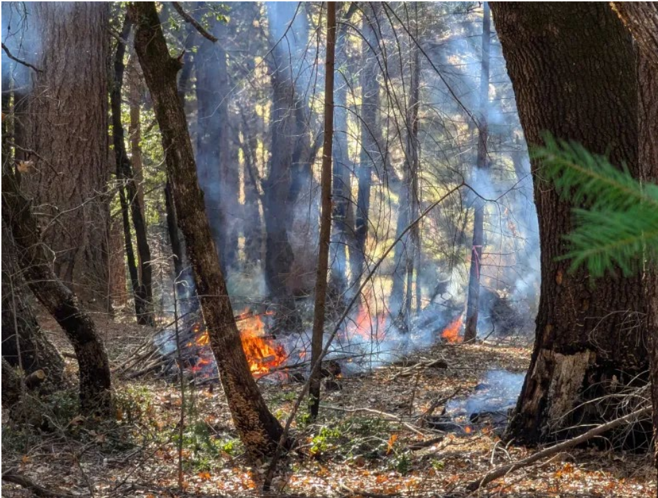
Piles of biological debris burn near Magalia, California on Monday, Dec. 2, 2024.

The pile burn project comes out to 109 acres of land scattered around Magalia and the reservoir with an additional 200 acres working with the Forest Service. More pile burns are planned toward northern Magalia further up the Skyway.