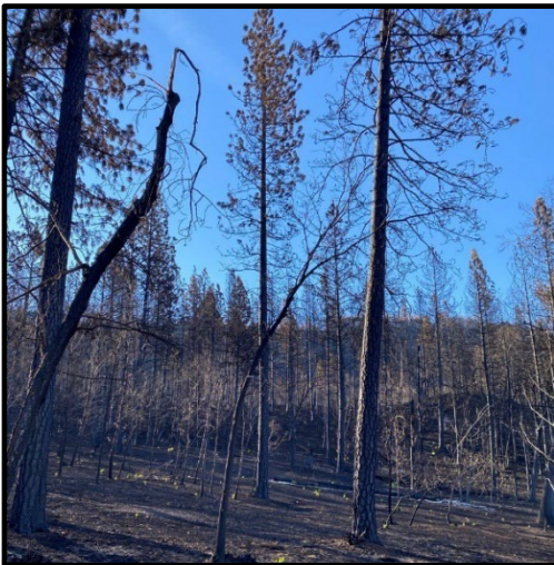
Before Park Fire Recovery Treatment