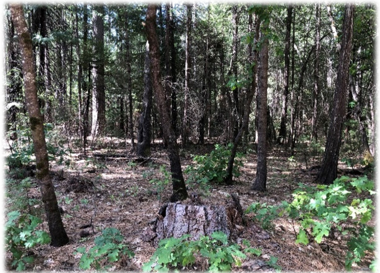
Overcrowded forest in Cohasset Loop

Set to commence in July 2024, this project will provide fuels reduction efforts within a rural community landscape. Through the strategic application of fuels reduction techniques, our objective is to establish a resilient zone within the wildland-urban interface (WUI), effectively reducing the potential impacts of wildfires on neighboring communities. This proactive strategy not only safeguards the residents of Cohasset but also contributes significantly to the long-term sustainability of our forests.