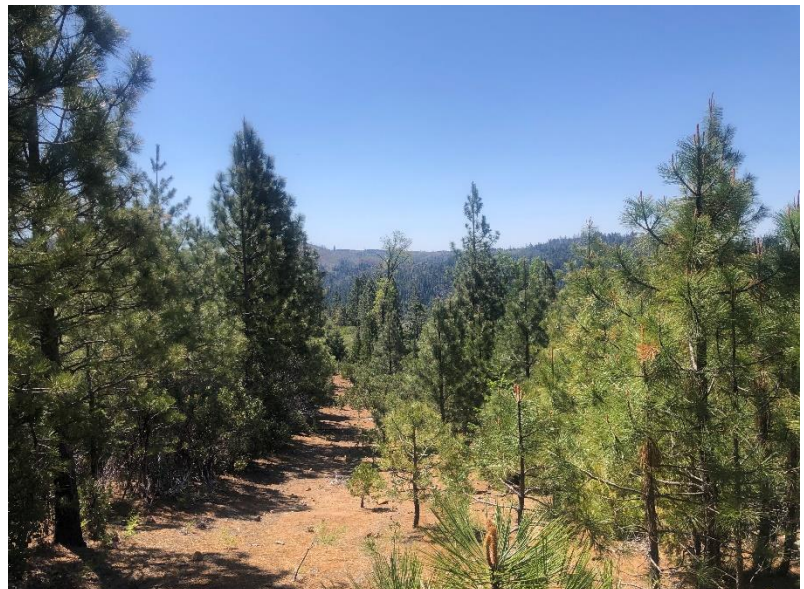
Overcrowded forest near Stirling City

The projects are expected to begin in late May of 2024. It will utilize innovative fuels reduction techniques to address the escalating wildfire threat within the wildland-urban interface (WUI) of Butte County. By safeguarding the communities of Paradise, Magalia, and Stirling City, we are also enhancing overall forest health for generations to come.