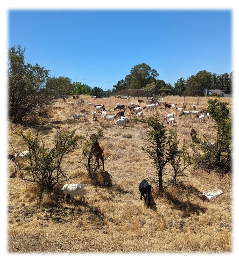
Hardworking, four-legged firefighters

Grazing projects, such as this, are threatened by the passing of the new California Labor Law AB 1099, due to take effect in January 2024. This would make it much more expensive to complete goat grazing projects for wildfire prevention, limiting the ability to protect evacuation routes in communities with grazing and making it unaffordable for grazing contractors to employ necessary staff. AB 1099 directly conflicts with California's strategy to reduce wildfire risk with "Targeted Grazing". The BCFSC completed over 1,000 acres of "Targeted Grazing" in just under three years. This new legislation could cease grazing projects in Butte County, and throughout the state. For more information about grazing, call the BCFSC office at 530-877-0984.