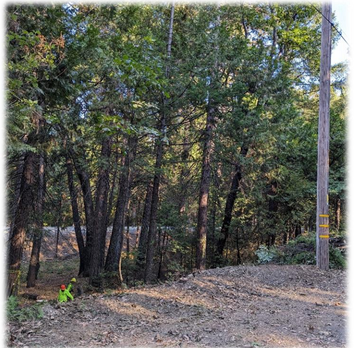
After: CCI Roadside Forest Ranch Homeplace / Hwy 32

As part of the ongoing effort to increase public safety and reduce hazardous fuels along evacuation routes, the Butte County Fire Safe Council (BCFSC) a non-profit, in partnership with CAL FIRE, funded by a California Climate Investments (CCI) Roadside Evacuation Hazardous Fuels Reduction grant, has started work in Forest Ranch. The project reduces wildfire hazards at a landscape level by improving and maintaining firefighter ingress and egress, improving evacuation, and protecting assets at risk. The scope of the project is to encourage and partner with WUI residents to reduce the horizontal and vertical continuity of forest fuel, specifically mature brush, overstocked young trees along evacuation routes, and access roads through thinning. Over time, effective reduction of vegetative fuels develops strong shaded fuel breaks, thereby reducing wildfire risk. The project is located along Headwaters Rd and several adjacent roads. The work is being completed by the BCFSC Fuels Crew and ties directly into previous Defensible Space work completed by our crews over the last year, with funding from the California Fire Safe Council.