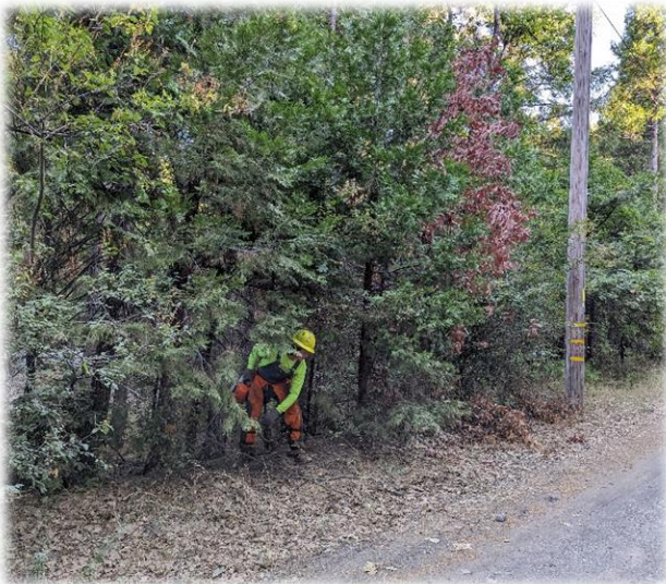
Before: CCI Roadside Forest Ranch Homeplace / Hwy 32

This project is part of a landscape level Wildland Urban Interface (WUI) fuels reduction project that will treat a total of 487 Acres located within the WUI communities of Cohasset, Forest Ranch, Forbestown, and Magalia, which includes four "Communities at Risk". There are three remaining ridges not yet been impacted by catastrophic wildfire - the communities of Cohasset, Forest Ranch, and Forbestown. The project fills an essential need by implementing fuels reduction along evacuation routes. In addition, effectiveness of adjacent shaded fuel breaks and hazardous fuels reduction projects will be strengthened by linking to roadside evacuation routes and access roads. The project leverages multiple partnerships to implement fuels reduction, increase fire prevention education, increase community resilience, improve public safety, and reduce greenhouse gas emissions.