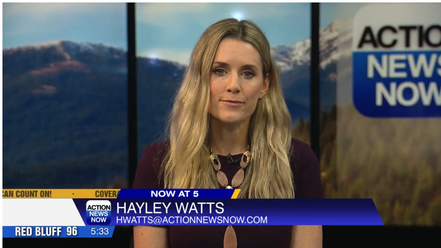
Firewise is a program that helps communities reduce wildfire risk and helps homeowners qualify for an insurance discount.

PARADISE, Calif. - Bille Park neighborhood in Paradise is now the first Firewise neighborhood in the town.