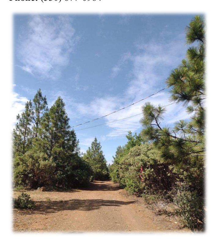
Before Bernlo fuels reduction.

Contact: Calli-Jane West Website: Buttefiresafe.net Phone: (530) 877-0984