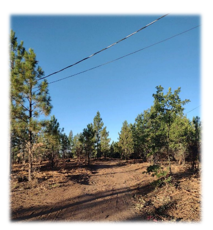
After Bernlo fuels reduction.

As part of the ongoing efforts to increase public safety and reduce hazardous fuels in the community of Cohasset, the Butte County Fire Safe Council (BCFSC) in partnership with the Cohasset Fire Safe Council, and Sierra Nevada Conservancy (SNC) will be conducting fuels reduction in the manner of mastication to reduce dense vegetation, as well as restore forest health and improve watershed resilience.