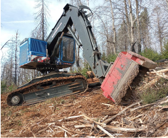
Fuels treatment with mastication.

"Our vision is to create communities within a landscape that are resistant to the devastating impacts of wildland fires."