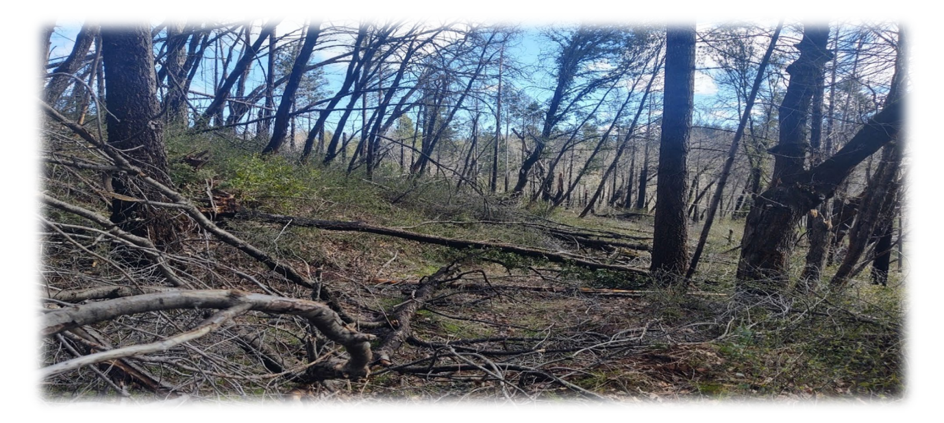
Figure 2: Unhealthy forest in the project area

The work is being conducted by the Butte County Fire Safe Council through a California Climate Investment (CCI) grant.