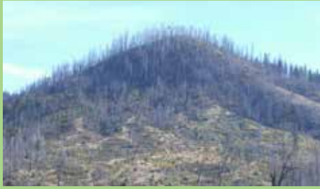
Concow in 2012, four years after the original 2008 Camp Fire.