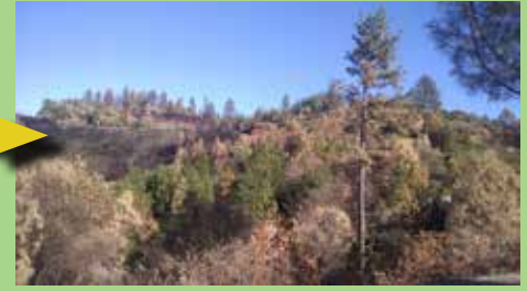
Yankee Hill, December 2018. The brush field reburned with high intensity.

Funding is needed for equipment to address brush regrowth!