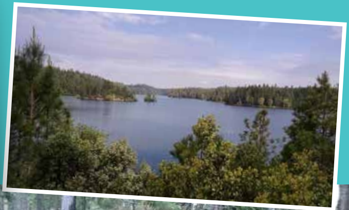
Photo below taken at the end of November 2018, after the Camp Fire came through the treated area. The forest around Paradise Lake remains green and drinking water is protected.

Little Butte Creek Forest Health Project II 176-acre project Completed Spring 2018 Funding: Sierra Nevada Conservancy and US Forest Service