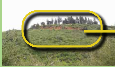
Yankee Hill shown in 2006, 12 years after the Ralston Fire.