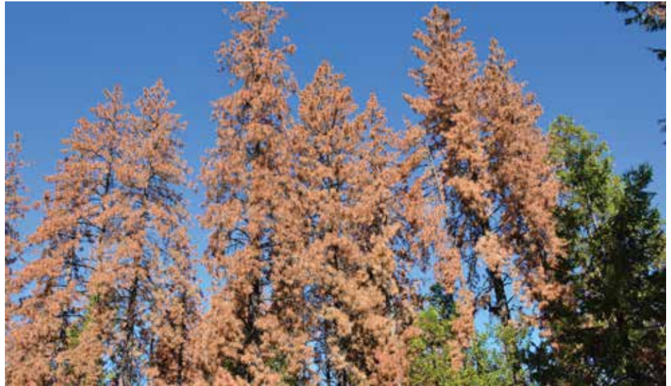
Millions of trees in California are dead due to bark beetle infestation.

Find information at this link about how you can deal with bark beetle infestation throughout the year: www.PrepareForBarkBeetle.org