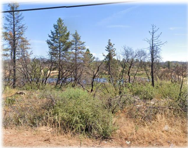
Kunkle Reservoir Grazing Project, 2023

As part of the ongoing effort to increase public safety and reduce hazardous fuels on the ridge, the Butte County Fire Safe Council (BCFSC) a non-profit, in partnership with CAL FIRE, will conduct 8 acres of fuels reduction with grazing south of Paradise. Funded by the California Climate Investments (CCI) Hazardous Fuels Reduction for Camp and North Complex Fires.