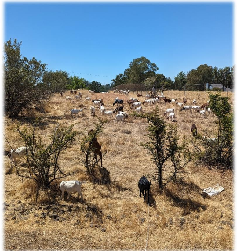
Hardworking, four-legged firefighters

Grazing projects, such as this, are threatened by the passing of the new California Labor Law AB 1099, due to take effect in January 2024. This would make it much more expensive to complete goat grazing projects for wildfire prevention, limiting the ability to protect evacuation routes in communities with grazing and making it unaffordable for grazing contractors to employ necessary staff. AB 1099 directly conflicts with California's strategy to reduce wildfire risk with "Targeted Grazing". The BCFSC completed over 1,000 acres of "Targeted Grazing" in just under three years. This new legislation could cease grazing projects in Butte County, and throughout the state. For more information about grazing, call the BCFSC office at 530-877-0984.