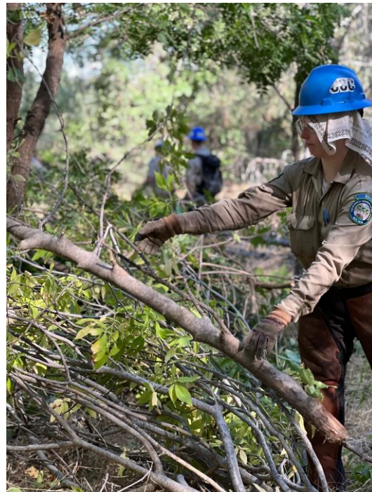
CCC Crew member adds brush to pile for chipping.