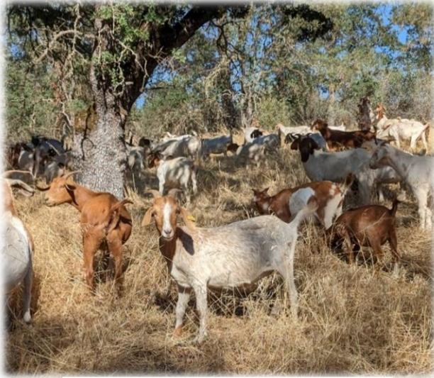
Ishi Middle School Grazing Project, 2023

Grazing projects, such as this, are threatened by the passing of the new California Labor Law AB 1099, due to take effect in January 2024. This would halt the ability to fund goat grazing projects for wildfire prevention, limiting the ability to protect schools and communities with grazing and making it unaffordable for grazing contractors to employ necessary staff. AB 1099 directly conflicts with California's strategy to reduce wildfire risk with "Targeted Grazing". The BCFSC completed over 1,000 acres of "Targeted Grazing" in just under three years. This new legislation could cease grazing projects in Butte County, and throughout the state. For more information about grazing, call us 530-877-0984.