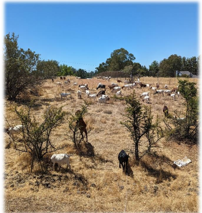
Hardworking, four-legged firefighters

This project is supported with private funds from the Butte County Fire Safe Council, raised with community donations, annual memberships, and fundraising at the 2023 Paradise Grazing Festival. Grazing is scheduled to continue through September 2023.