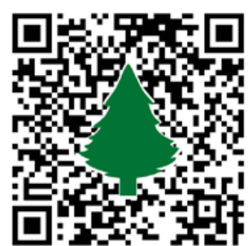
READ or DOWNLOAD: Cohasset Forest Management Plan

The document can be viewed online or downloaded as a PDF.