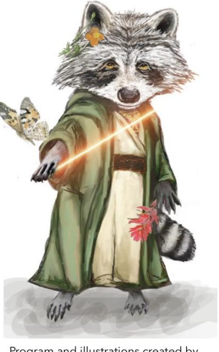
Program and illustrations created by Miriam Morrill @Pyrosketchology