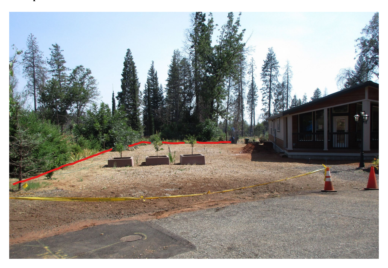
*Property boundary is noted in red.