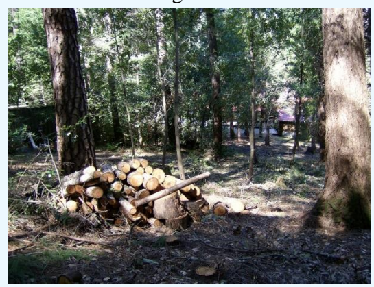
Figure 4: Example of fuel loads in Lake Madrone, Berry Creek.

CERT program, a telephone tree manned by Firewise captains in each area, and a 1950's style knocking on doors. All were in progress, but the fire would not wait for us. What it did show me was what would work and what would not. Early warning can be done by area captains, some of whom were out of the area, but this takes hands. When people are packing up, they don't have time to take cell phone calls or to make them. Landline phones are stationery and in our case the message machines were not working because PG&E had our power off. This meant