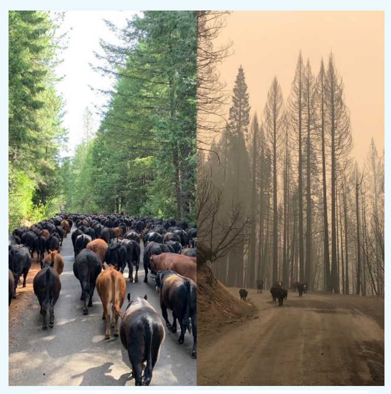
Figure 1: Cattle grazing in Plumas National Forest before and after the North Complex fire.