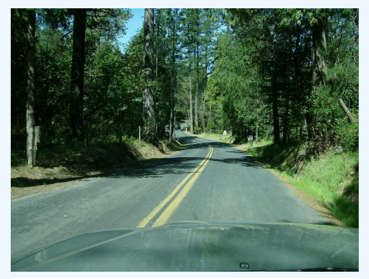
Figure 1: Overgrown roadside fuels in Berry Creek, CA