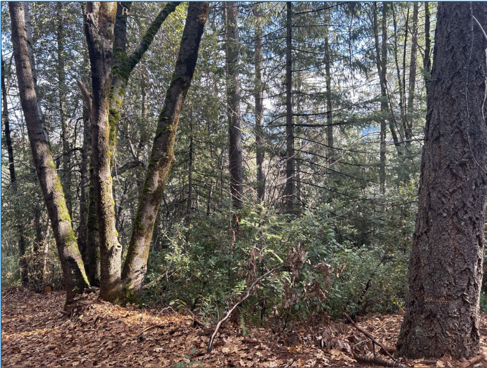
Figure 1 - Platt Mountain Community Project Untreated Area, Forest Ranch