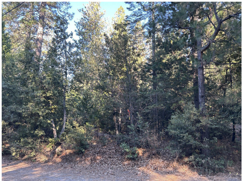
Figure 2 - Platt Mountain Community Project Untreated Area, Forest Ranch

Funding for this project provided by the California Department of Forestry and Fire Protection's Forest Health Program as part of the California Climate Investments Program