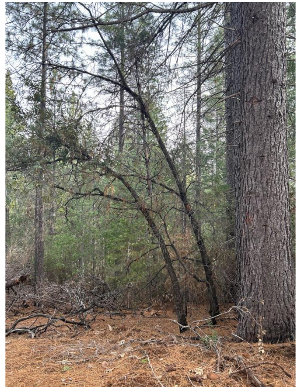
Forest Ranch untreated area

The project is strategically located along Doe Mill Road (south of Schott Road), spanning 308 acres of treatment. The location is part of a greater effort to connect previously completed and upcoming projects to provide overall community safety. Understory vegetation will be reduced through mechanical mastication to establish a fuel break for the community. Additionally, hand cut and pile units will be strategically placed to ensure the fuel load is effectively reduced through planned prescribed fire. Work is scheduled to begin at the end of April and will continue until the project is completed.