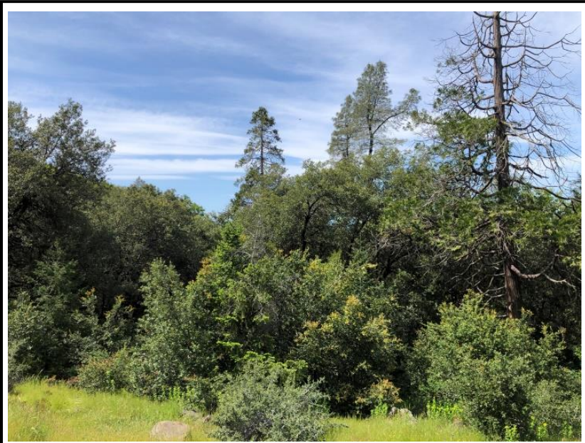
Before Hand Cut & Pile Burn Treatment (2024)