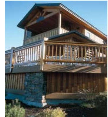
Enclose under decks so firebrands do not fly under and collect.